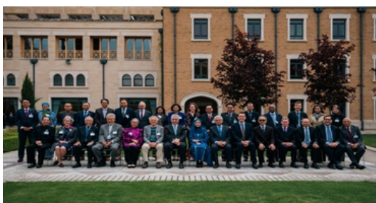
OXFORD CENTRE FOR ISLAMIC STUDIES - UTM SCIENCE ROUNDTABLE Oxford, United Kingdom