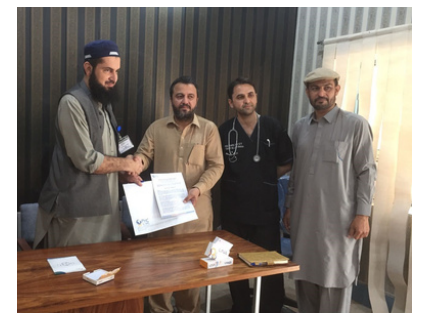
DISTRICT HEADQUARTER HOSPITAL, BANNU