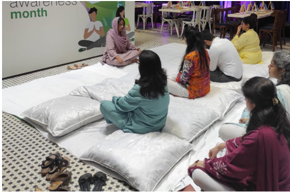
ARTS AND WELLNESS SESSION FOR ENGRO CORP. IN PARTNERSHIP WITH KARACHI BIENNALE TRUST