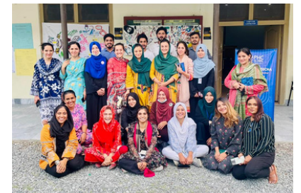
SOCIAL WELFARE DEPARTMENT, GILGIT-BALTISTAN