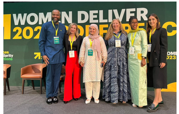
WOMEN DELIVER CONFERENCE 23 Kigali, Rwanda