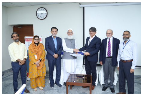
HEALTH RESEARCH ADVISORY BOARD