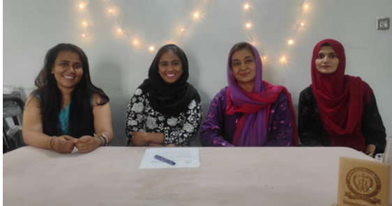
CARE FOR HEALTH

PHC Global, this year expanded the impact of their work to collaborate with other organizations. Given our methodological approach to public health, these Memorandum of Understanding (MOU) were signed to put our efforts together to address issues in evidence generation, advocacy, capacity-building, and science.