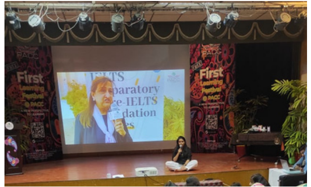
SOCIAL EMOTIONAL AWARENESS SESSION FOR LEARNING FESTIVAL BY PAKISTAN AMERICAN CULTURAL CENTRE