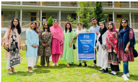
KARAKORUM INTERNATIONAL UNIVERSITY GILGIT