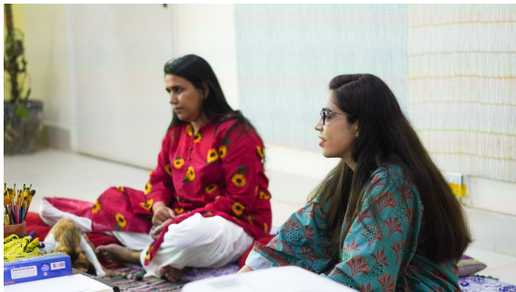
DANCE MANDALA AND MENDING HEARTS WORKSHOP WITH HOUSE OF PEBBLES