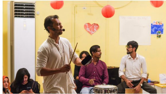
CATHARSIS DRUM CIRCLE BY THE KARACHI DRUM