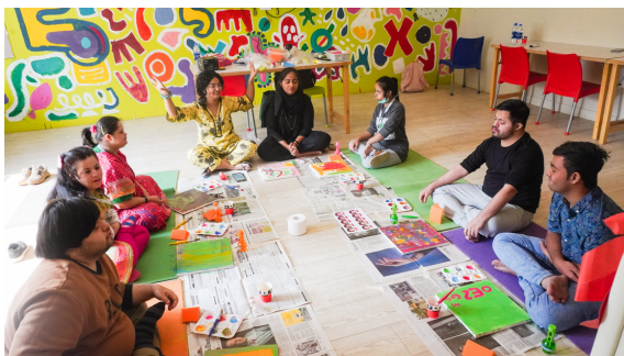
SOCIAL EMOTIONAL LEARNING SESSION FOR KARACHI DOWN SYNDROME PROGRAM (KDSP)