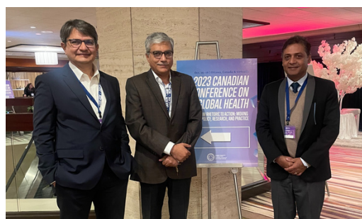
CANADIAN CONFERENCE ON GLOBAL HEALTH Ottawa, Canada