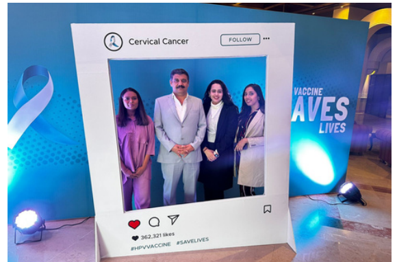
NATIONAL HPV SEMINAR Islamabad, Pakistan