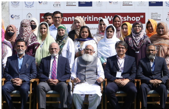
2ND GRANT WRITING WORKSHOP Riphah University, Rawalpindi, Pakistan