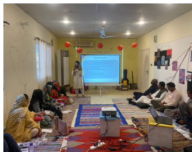
HOUSE OF PEBBLES