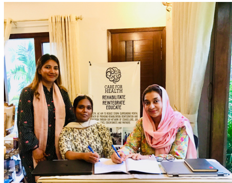
CARE FOR HEALTH