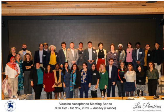
FOUNDATION MÉRIEUX'S VACCINE ACCEPTANCE CONFERENCE Anancy, France