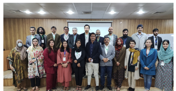
13TH INTERNATIONAL PUBLIC HEALTH CONFERENCE Islamabad, Pakistan